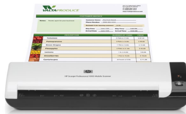
1,800 points HP Scanjet Professional 1000 Mobile Scanner L2722A