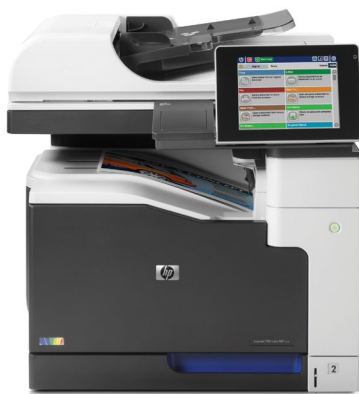
30,725 points HP LaserJet Enterprise 700 Color MFP M775dn CC522A