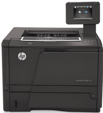
3,225 points HP LaserJet Pro 400 Printer M401dw CF285A