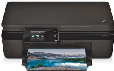
950 points HP Photosmart 5520 e-All-in-One Printer CX042A