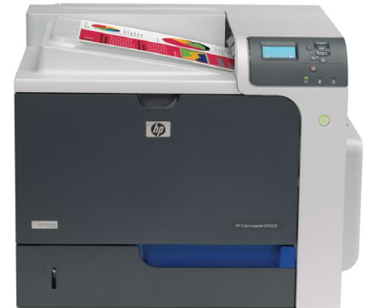
3,225 points HP Color LaserJet Enterprise CP4525n Printer CC493A