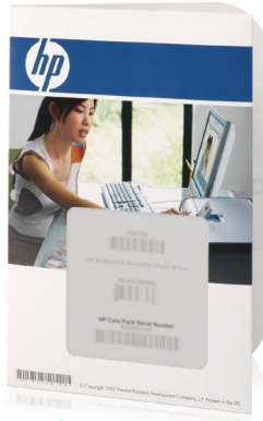
250 points HP Care Pack