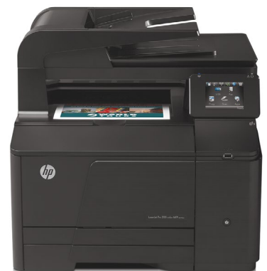
3,225 points HP LaserJet Pro 200 Color MFP M276nw CF145A