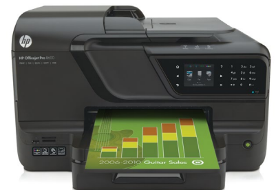
1,450 points HP Officejet Pro 8600 Printer CM749A